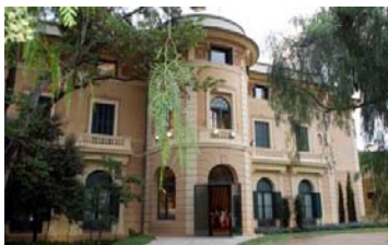
The UfM Secretariat is the operational institution that empowers the regional dialogue between the UfM Member States and stakeholders for the promotion of regional cooperation projects and initiatives

Trimestral meetings of the Ambassadors of the 43 countries