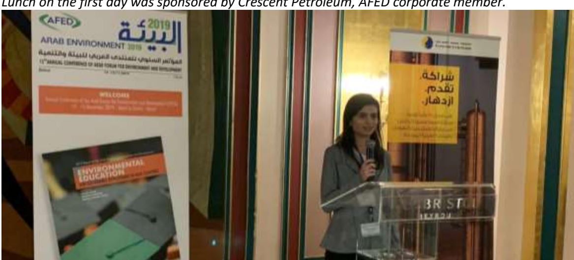
Lunch on the first day was sponsored by Crescent Petroleum, AFED corporate member.

In order to promote education on sustainability at all levels (both formal and informal), the UfM is working, jointly with the Regional Activity Centre for Sustainable Consumption and Production of the United Nations Environment Programme - Mediterranean Action Plan (SCP/RAC) and the Mediterranean Information Office for Environment, Culture and Sustainable Development (MIO-ECSDE), on the publication "Education for Sustainable Consumption, Behaviour and Lifestyles".